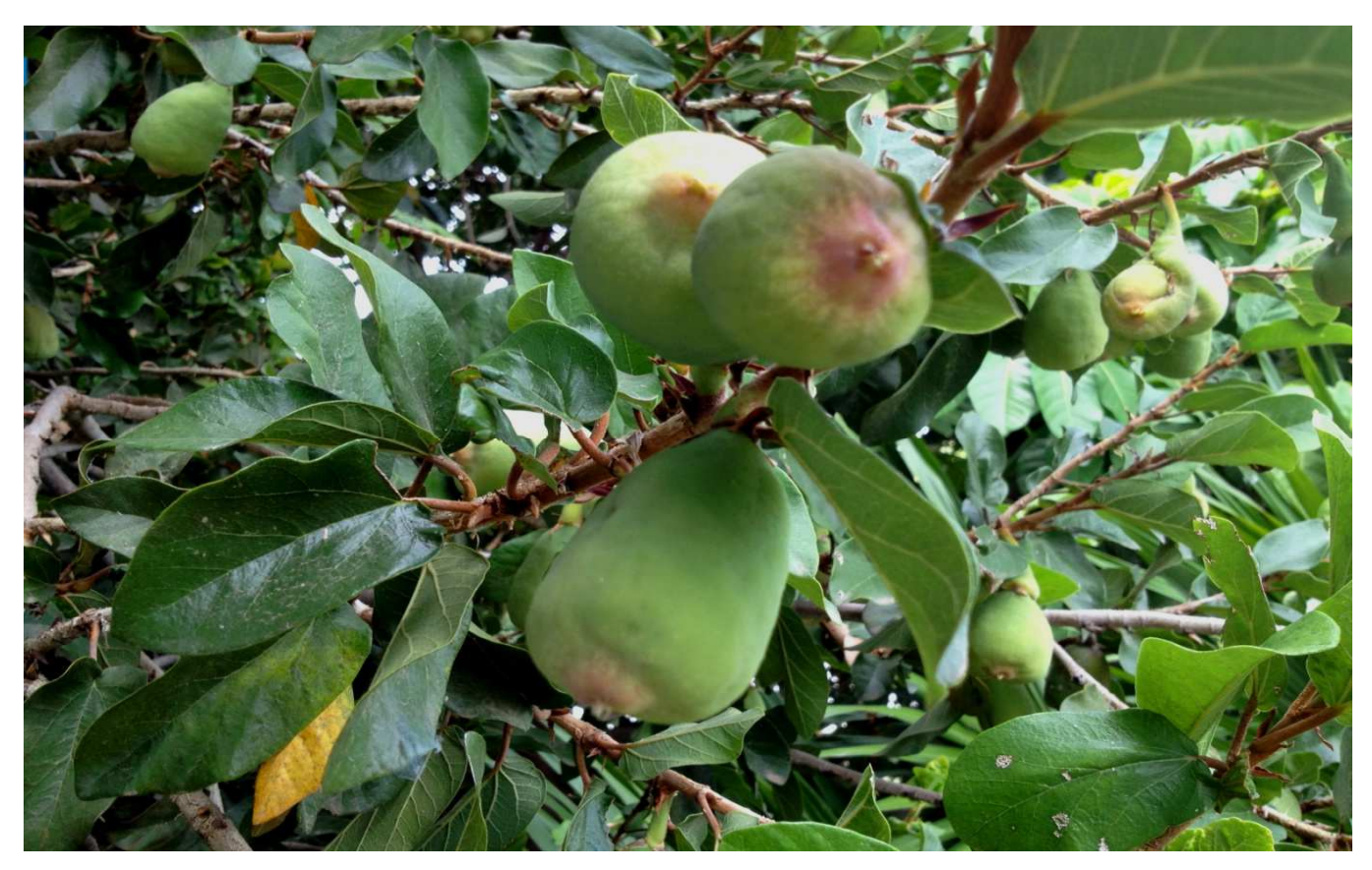
Figure No.3: Photograph of Ficus pumila L. showing fruits and leaves